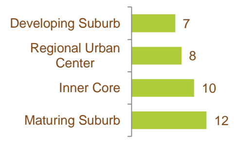
FIGURE ES-2 MPO MUNICIPALITIES CONTAINING FFYS 2019-23 TIP PROGRAM PROJECTS BY COMMUNITY TYPE